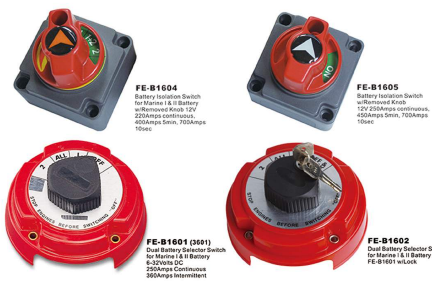
FE-B1604 Battery Isolation Switch for Marine I & II Battery w/Removed Knob 12V 220Amps continuous, 400Amps 5min, 700Amps 10sec FE-B1605 Battery Isolation Switch w/Removed Knob 12V 250Amps continuous, 450Amps 5min, 700Amps 10sec FE-B1601 (3601) Dual Battery Selector Switch for Marine I & II Battery 6-32Volts DC 250Amps Continuous 360Amps Intermittent FE-B1602 Dual Battery Selector Switch for Marine I & II Battery FE-B1601 w/Lock