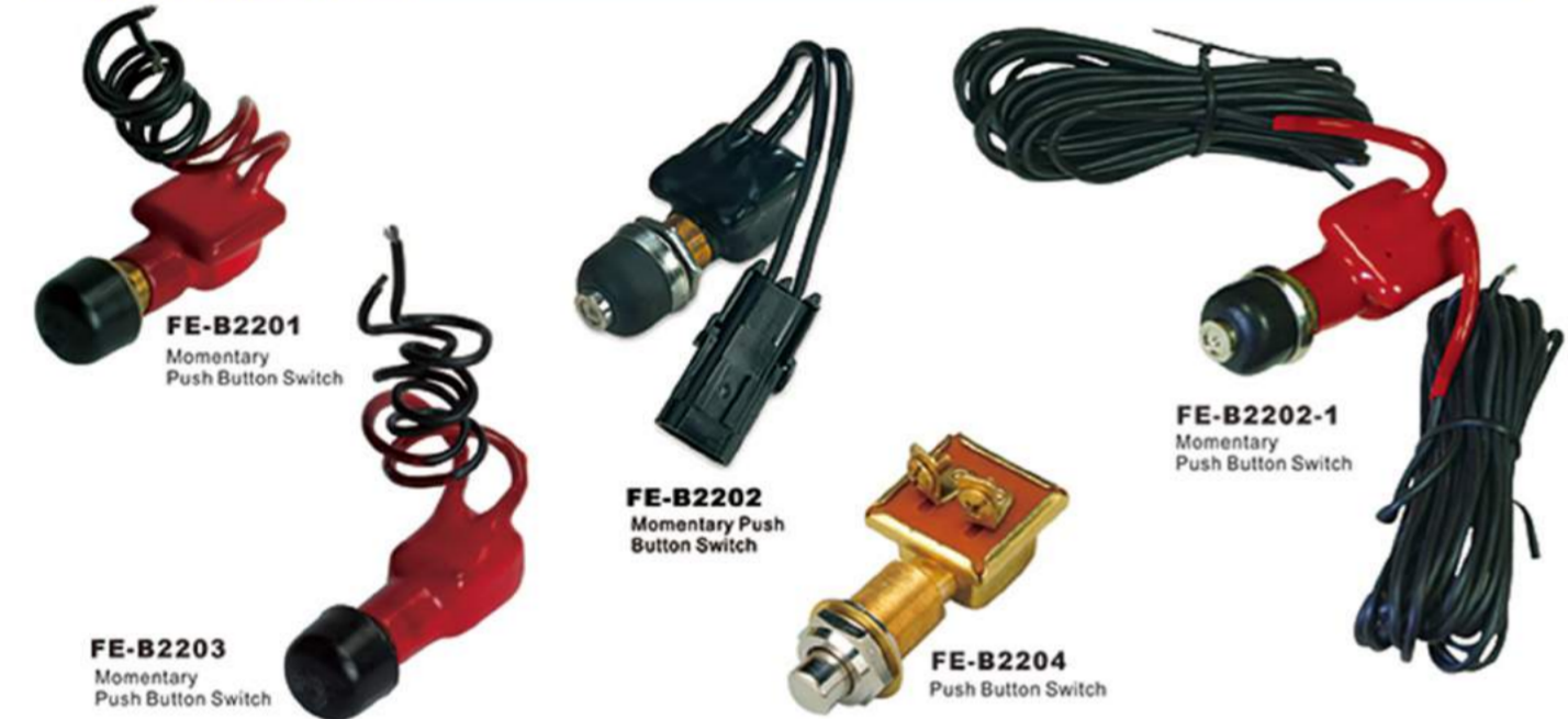
FE-B2201 Momentary Push Button Switch FE-B2202 Momentary Push Button Switch FE-B2203 Momentary Push Button Switch FE-B2204 Push Button Switch FE-B2202-1 Momentary Push Button Switch