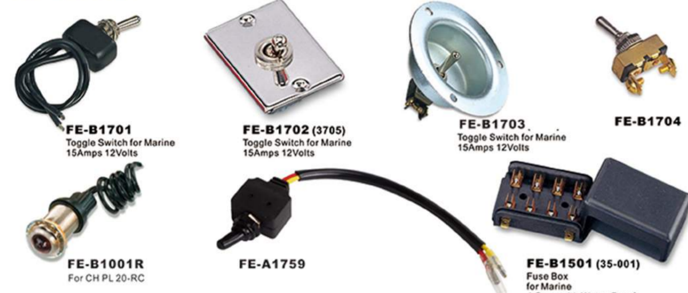
FE-B1701 Toggle Switch for Marine 15Amps 12Volts FE-B1702 (3705) Toggle Switch for Marine 15Amps 12Volts FE-B1703 Toggle Switch for Marine 15Amps 12Volts FE-B1704 FE-A1759 FE-B1501 (35-001) Fuse Box for Marine 4 Gang with Water-Proof Rubber