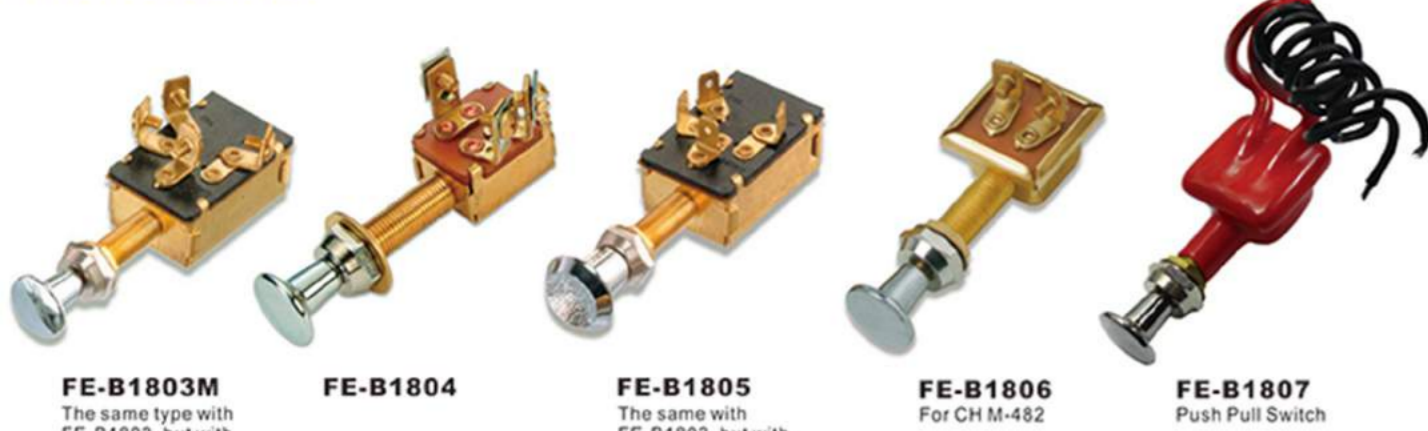
FE-B1803M The same type with FE-B1803, but with different Button FE-B1804 FE-B1805 The same with FE-B1803, but with 4 Blade Terminals FE-B1806 For CH M-492 FE-B1807 Push Pull Switch