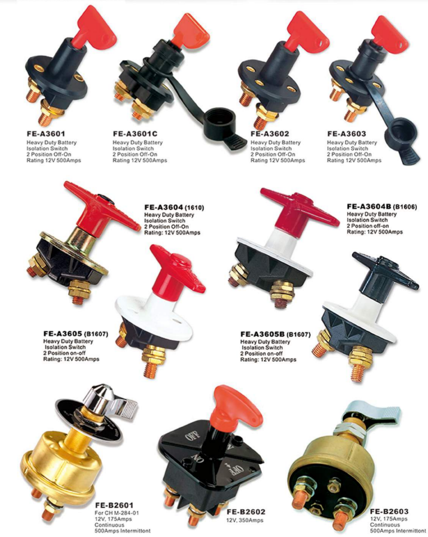
FE-A3601 Heavy Duty Battery Isolation Switch 2 Position Off-On Rating: 12V 500Amps FE-A3601C Heavy Duty Battery Isolation Switch 2 Position Off-On Rating: 12V 500Amps FE-A3602 Heavy Duty Battery Isolation Switch 2 Position Off-On Rating: 12V 500Amps FE-A3603 Heavy Duty Battery Isolation Switch 2 Position Off-On Rating: 12V 500Amps FE-A3604 (1610) Heavy Duty Battery Isolation Switch 2 Position Off-On Rating: 12V 500Amps FE-A3604B (B1606) Heavy Duty Battery Isolation Switch 2 Position Off-On Rating: 12V 500Amps FE-A3605 (B1607) Heavy Duty Battery Isolation Switch 2 Position on-off Rating: 12V 500Amps FE-A3605B (B1607) Heavy Duty Battery Isolation Switch 2 Position on-off Rating: 12V 500Amps FE-B2601 For CH M-284-01 12V, 175Amps Continuous 500Amps Intermittent FE-B2602 12V, 350Amps FE-B2603 12V, 175Amps Continuous 500Amps Intermittent