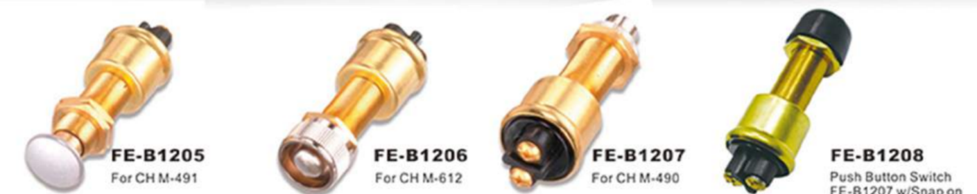
FE-B1205 For CH M-491 FE-B1206 FE-B1207 For CH M-490 FE-B1208 Push Button Switch FE-B1207 w/Snap on rubber cap 12V 35Amps