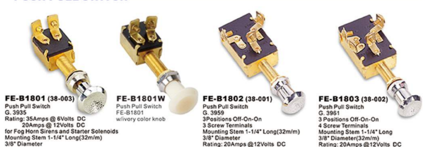
FE-B1801 (38-003) Push Pull Switch G. 3935 Rating: 35Amps @6Volts DC 20Amps @12Volts DC for Fog Horn Sirens and Starter Solenoids Mounting Stem 1-1/4" Long(32mm) 3/8" Diameter FE-B1801W Push Pull Switch FE-B1801 w/ivory color knob FE-B1802 (38-001) Push Pull Switch G. 3959 3 Positions Off-On-On 3 Screw Terminals Mounting Stem 1-1/4" Long(32mm) 3/8" Diameter Rating: 20Amps @12Volts DC FE-B1803 (38-002) Push Pull Switch G. 3981 3 Positions Off-On-On 4 Screw Terminals Mounting Stem 1-1/4" Long 3/8" Diameter(32mm) Rating: 20Amps @12Volts DC