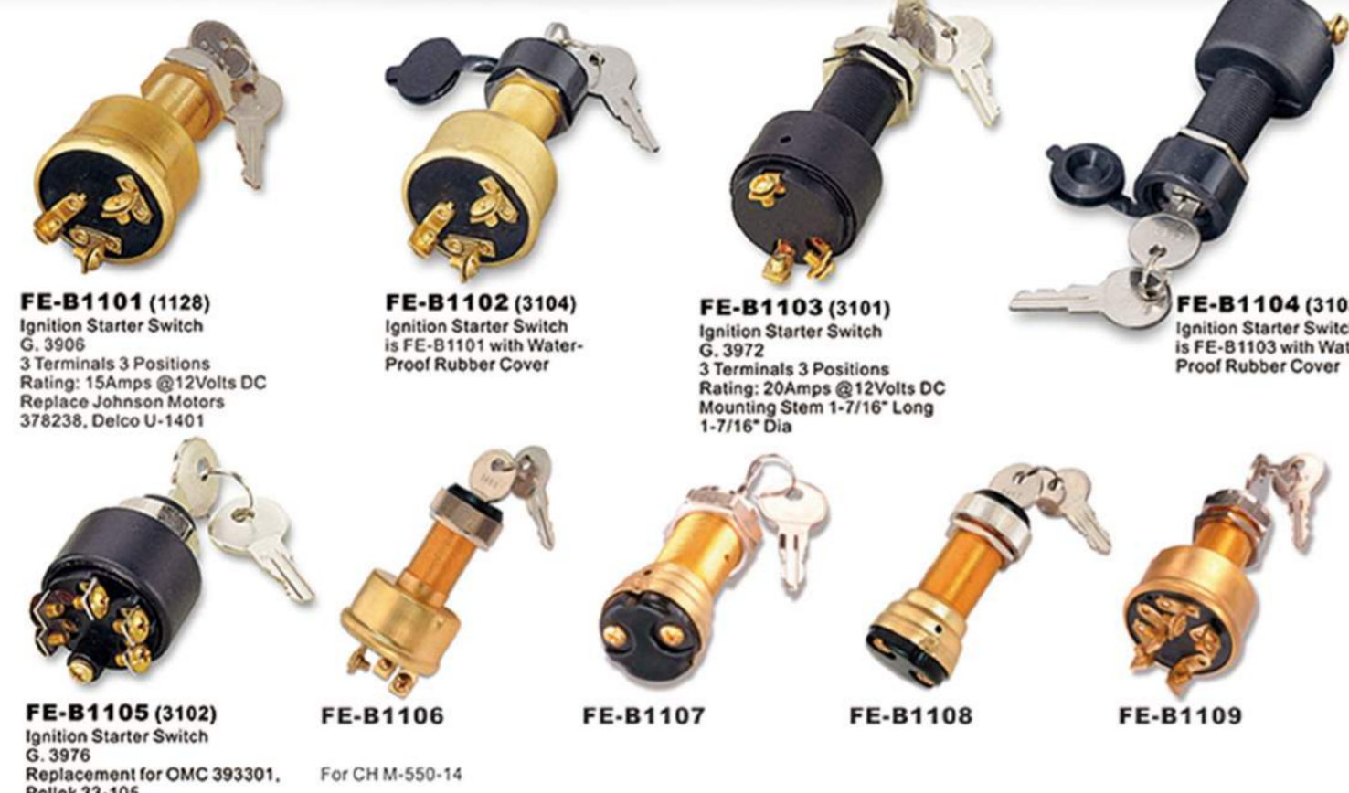
FE-B1101 (1128) Ignition Starter Switch G. 3906 3 Terminals 3 Positions Rating: 15Amps @12Volts DC Replace Johnson Motors 378238, Delco U-1401 FE-B1102 (3104) Ignition Starter Switch is FE-B1101 with Water-Proof Rubber Cover FE-B1103 (3101) Ignition Starter Switch G. 3972 3 Terminals 3 Positions Rating: 20Amps @12Volts DC Mounting Stem 1-7/16" Long 1-7/16" Dia FE-B1104 (3103) Ignition Starter Switch is FE-B1103 with Water-Proof Rubber Cover FE-B1105 (3102) Ignition Starter Switch G. 3976 Replacement for OMC 393301, Pollok 33-105, Fits Most OMC in Board/ Outboard Powered Boats FE-B1106 For CH M-550-14 FE-B1107 FE-B1108 FE-B1109