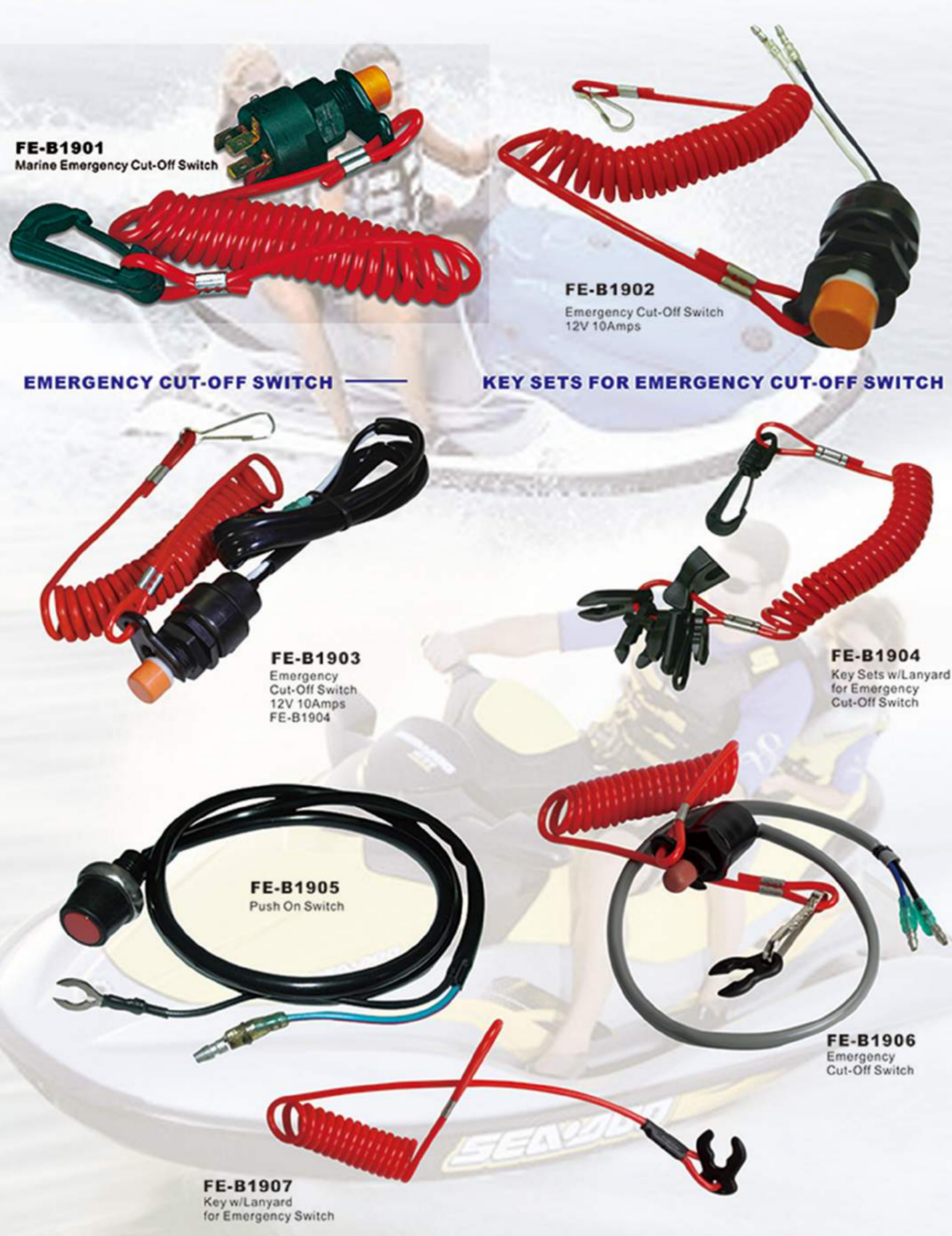
FE-B1901 Marine Emergency Cut-Off Switch FE-B1902 Emergency Cut-Off Switch 12V 10Amps EMERGENCY CUT-OFF SWITCH KEY SETS FOR EMERGENCY CUT-OFF SWITCH FE-B1903 Emergency Cut-Off Switch 12V 10Amps FE-B1904 FE-B1904 Key Sets w/Lanyard for Emergency Cut-Off Switch FE-B1905 Push On Switch FE-B1906 Emergency Cut-Off Switch FE-B1907 Key w/Lanyard for Emergency Switch