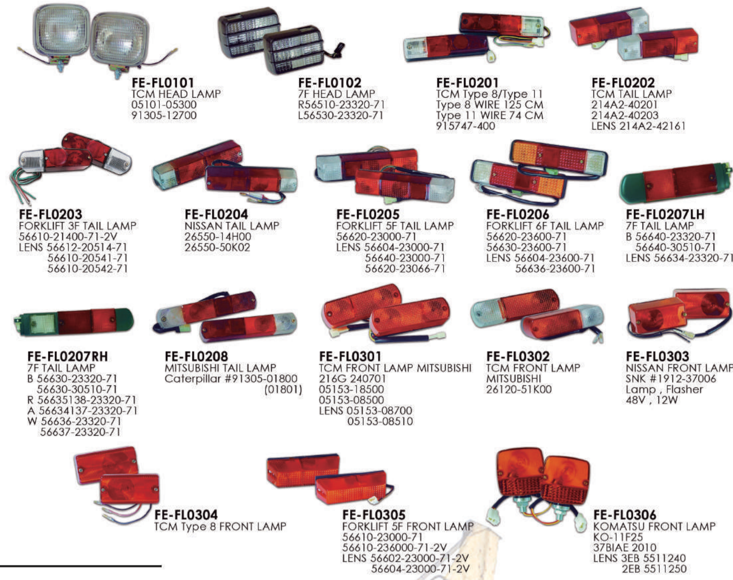
FE-FL0101 TCM HEAD LAMP 05101-05300 91305-12700