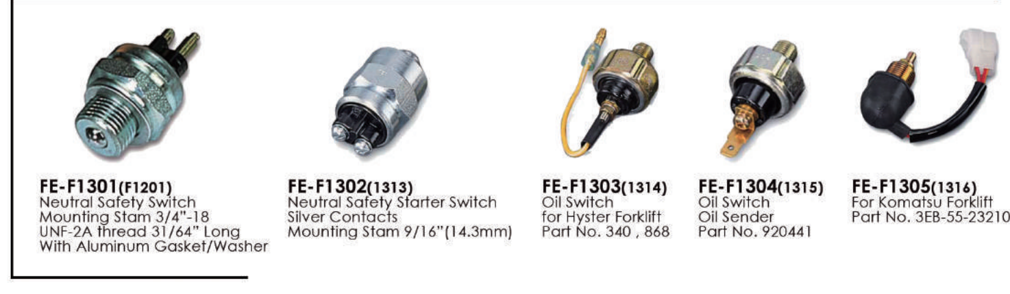
FE-F1301(1201) Neutral Safety Switch Mounting Stam 3/4"-18 UNF-2A Thread 3/16" Long With Aluminum Gasket/Washer