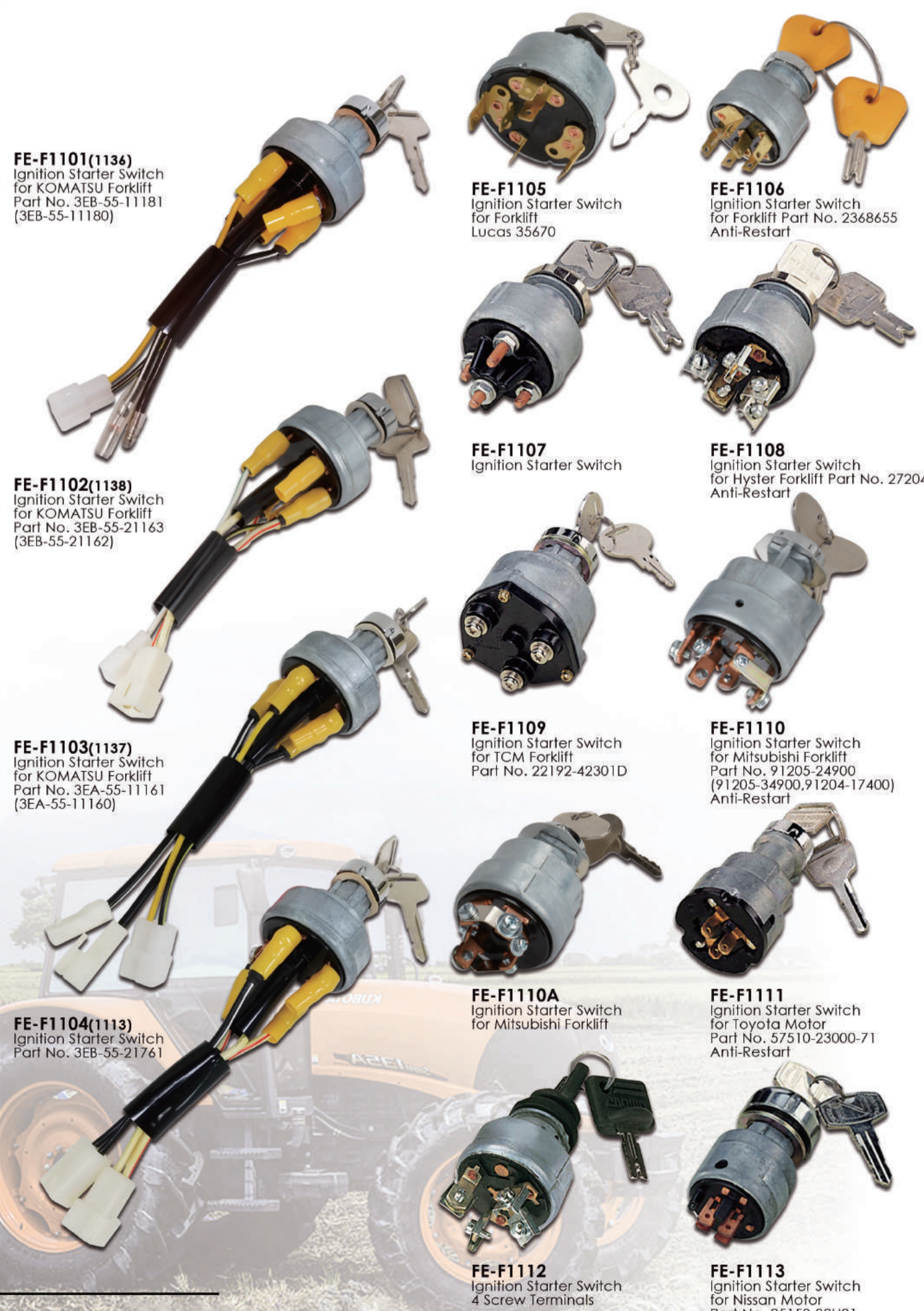
FE-F1101(1136) Ignition Starter Switch for KOMATSU Forklift Part No. 3EB-55-11181 (3EB-55-11180)