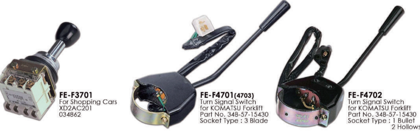
FE-F3701 Turn Signal Switch For Shopping Cars XD2AC201 034862