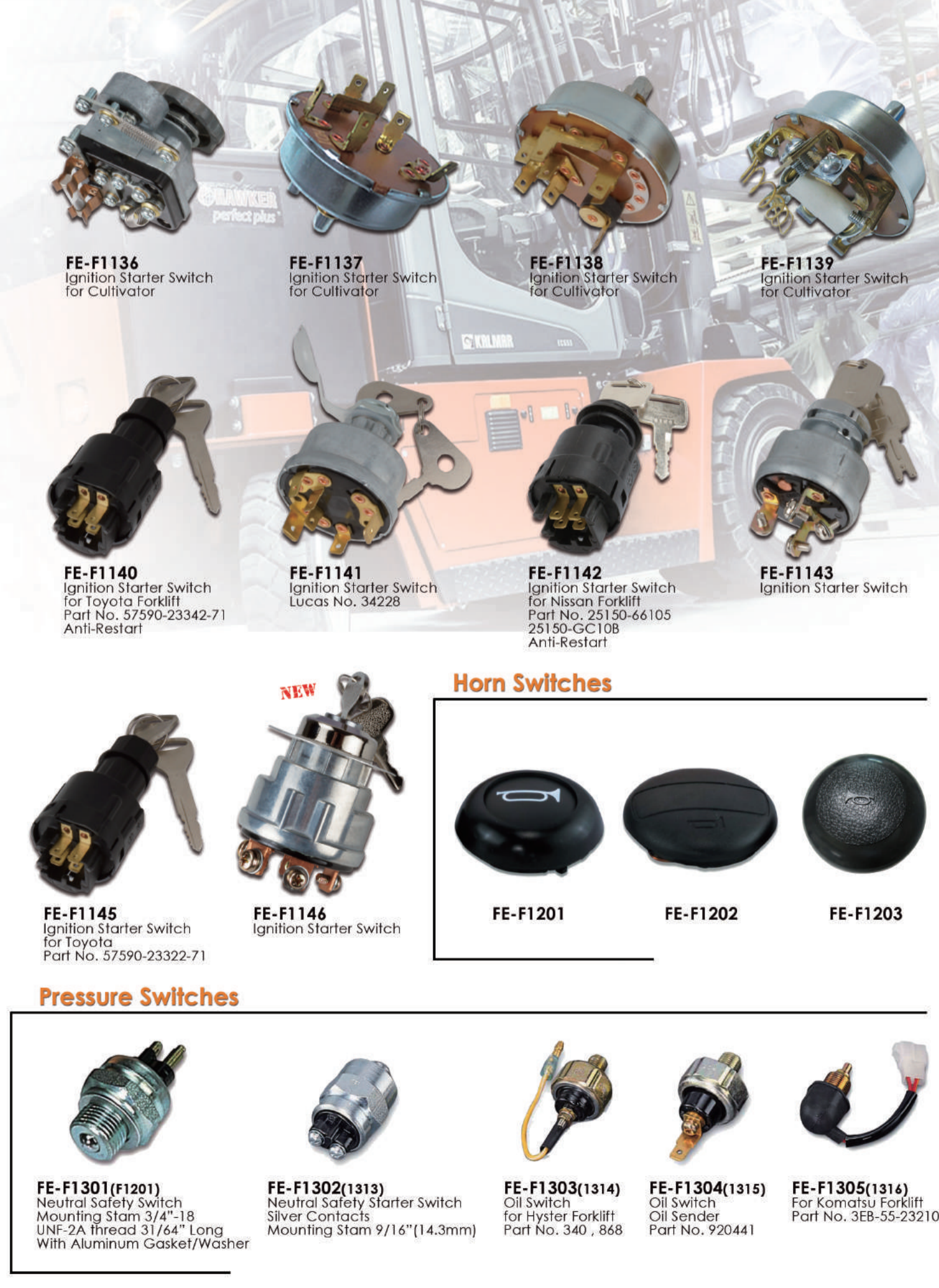
FE-F1136 Ignition Starter Switch for Cultivator