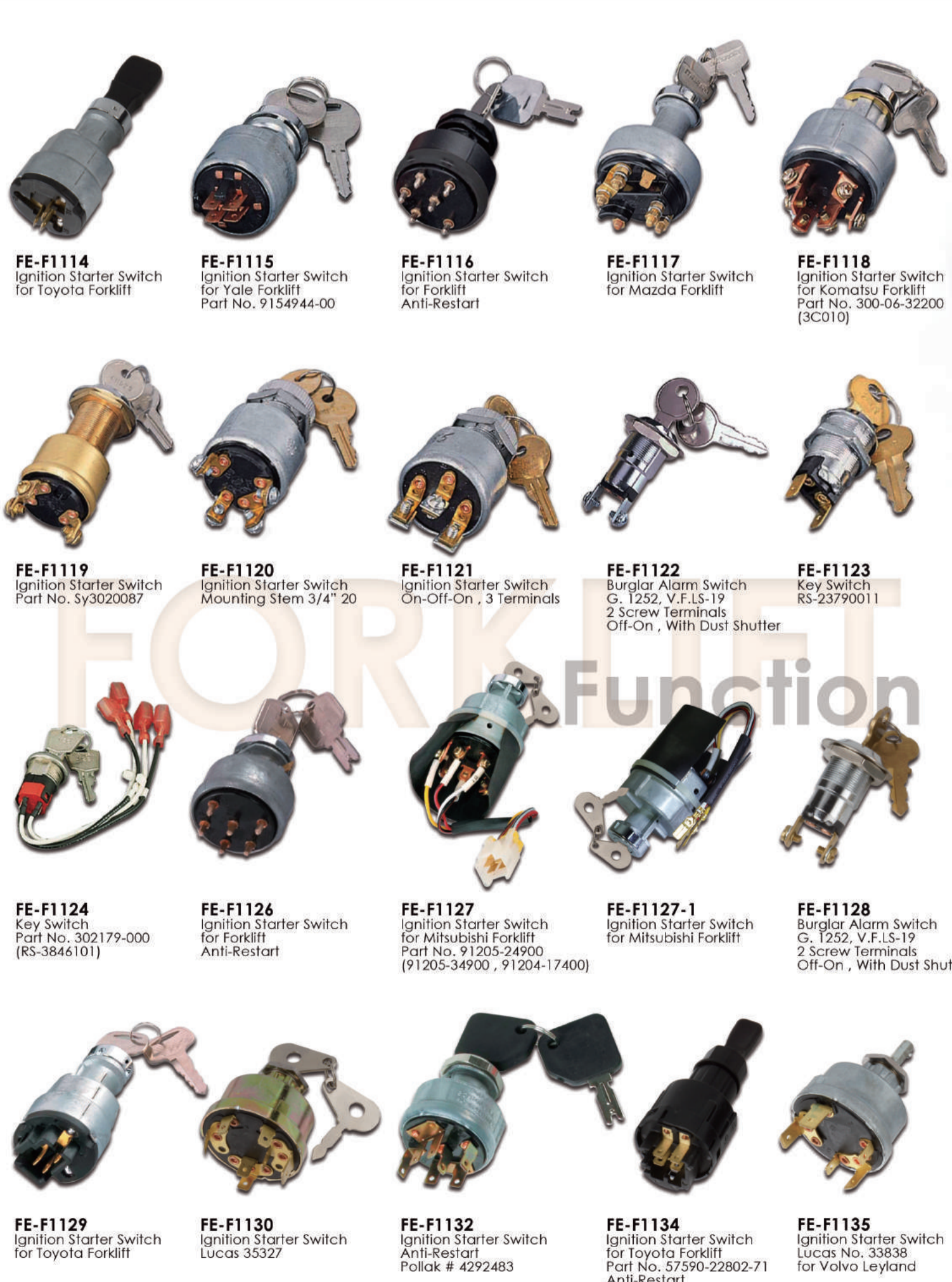
FE-F1114 Ignition Starter Switch for Toyota Forklift