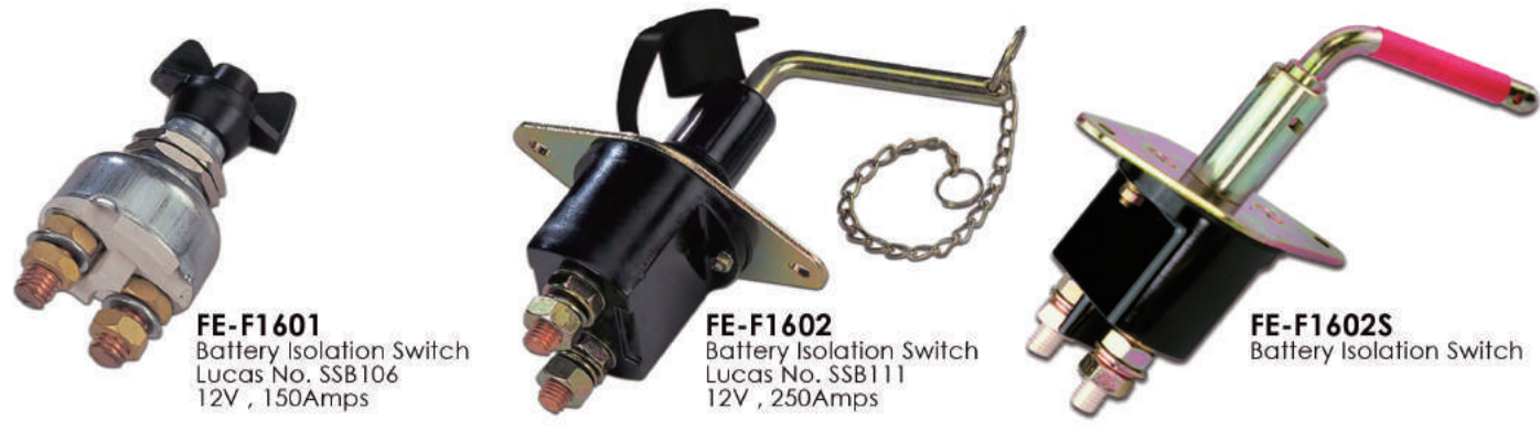
FE-F1601 Battery Isolation Switch Lucas No. SSB106 12V, 150Amps