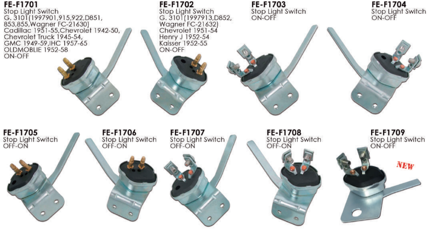
FE-F1701 Stop Light Switch G. 310 (1997901, 915, 922, D851, 853, 855, Wagner FC-21430) Cadillac 1951-55, Chevrolet 1942-50, Chevrolet Truck 1945-54, GMC 1949-59, JHC 1957-65 OLDMOBILE 1952-58 ON-OFF